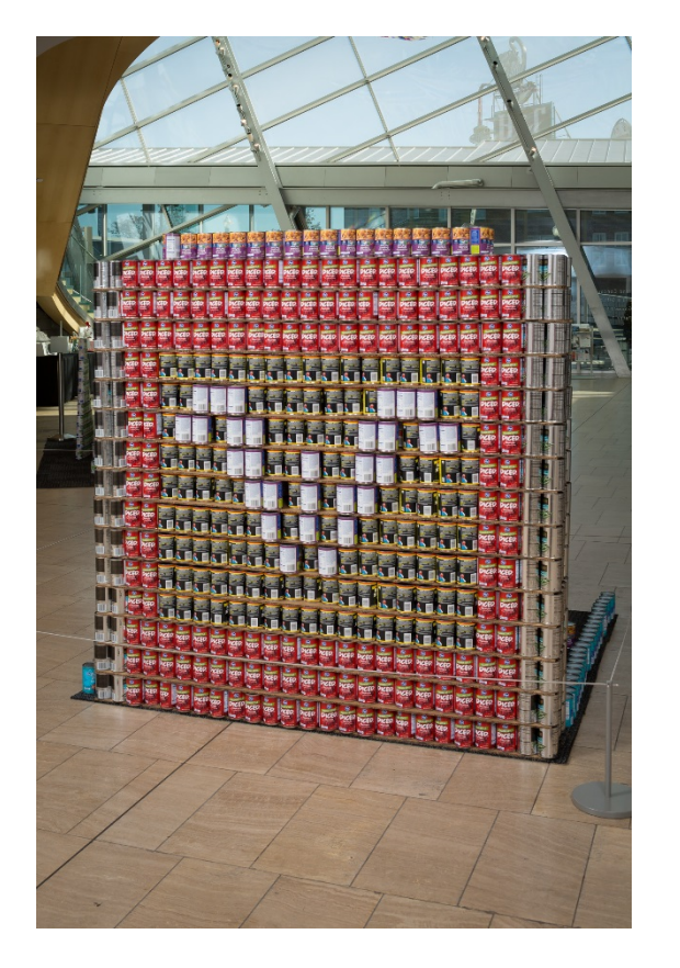
"Hats Off to Willy Wonka!" - Roanoke County Public Schools, Burton Center for Arts and Technology